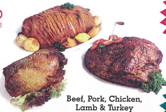
Beef, Pork, Chicken, Lamb & Turkey