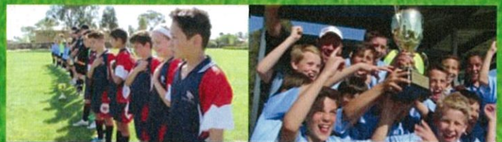
2014 DOC Community Cup Champions and Runners-up

REGISTER NOW AND DON'T MISS OUT ON THE LARGEST TOURNAMENT OF ITS KIND