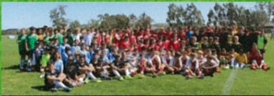
DOC Community Cup Melbourne 2014

We are also proud to announce we will be running the inaugural GIRLS ONLY DOC Community Cup in 2015